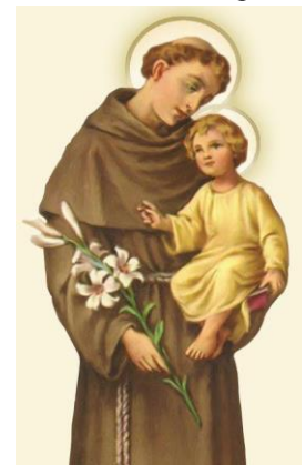
St Antony of Padua – 13 June