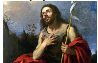
St John the Baptist – 24 June