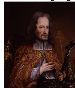
St Oliver Plunkett 1 July