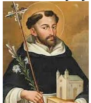
St Dominic 8 August