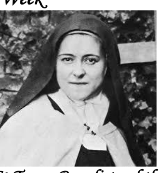
St Teresa Benedicta of the Cross (Edith Stein) 9 August