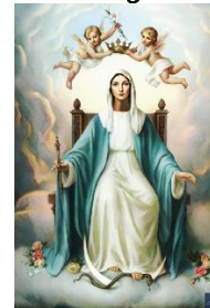
Queenship of Mary 22 August