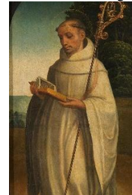
St Bernard 20 August