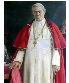
St Pius X 21 August