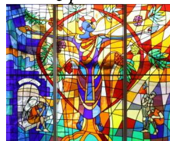
St Mac Nissi 4 September