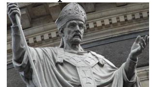
St John Chrysostom 13 September