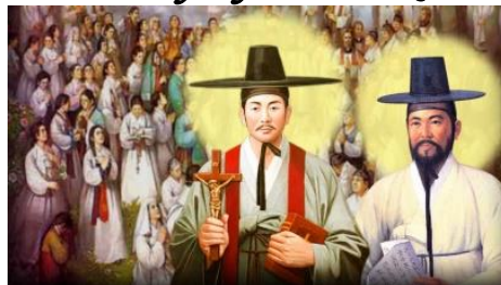
Ss Andrew Kim Taegon, Paul Chong Hasang and Companions 20 September