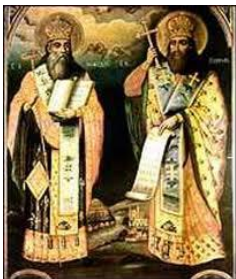
Ss Cornelius & Cyprian 15 September