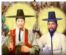
Ss Andrew Kim Taegon, Paul Chong Hasang and Companions – 20 September