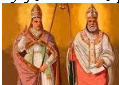
Ss Cornelius & Cyprian – 16 September