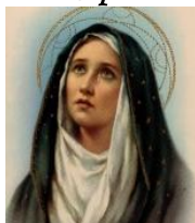
Our Lady of Sorrows – 15 September