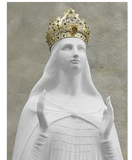
Our Lady of Knock 17 August

CORK CATHEDRAL FAMILY OF PARISHES South Parish/Ss Peter & Paul's/St. Patrick's/Blackpool/Glen/Ballyvolane/Sunday's Well