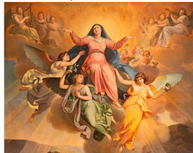
Assumption of the Blessed Virgin Mary 15 August